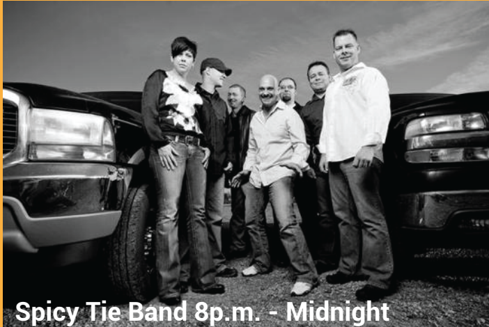
Spicy Tie Band 8p.m. - Midnight